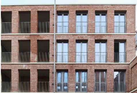
Den Dam – Antwerp